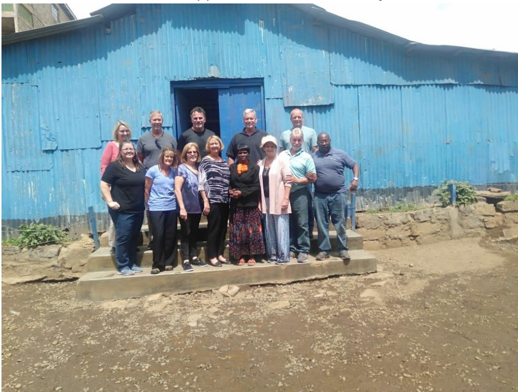
End of day one