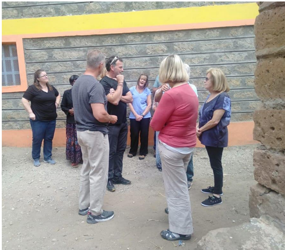
Tour of the original toilets of spring valley before Pinellas church built the modern ones in the school