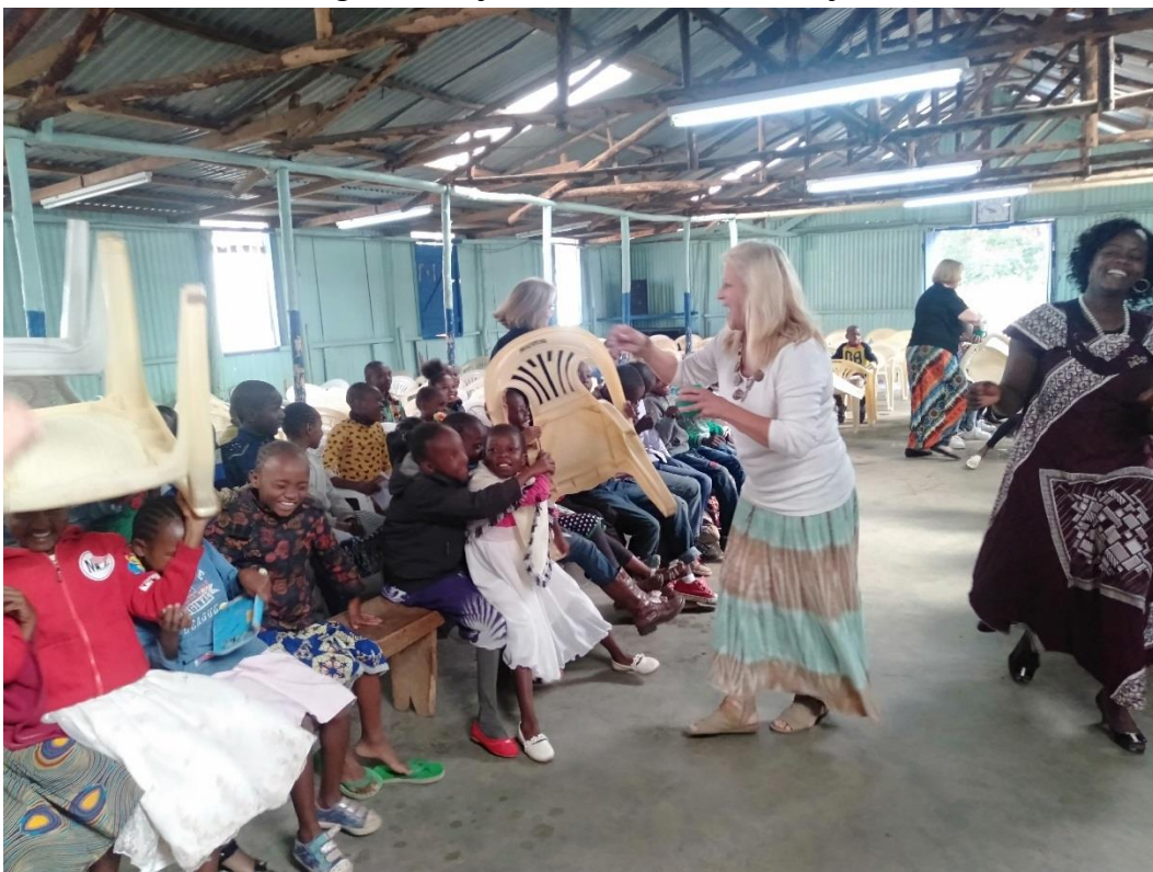
The children having fun while recreating the story