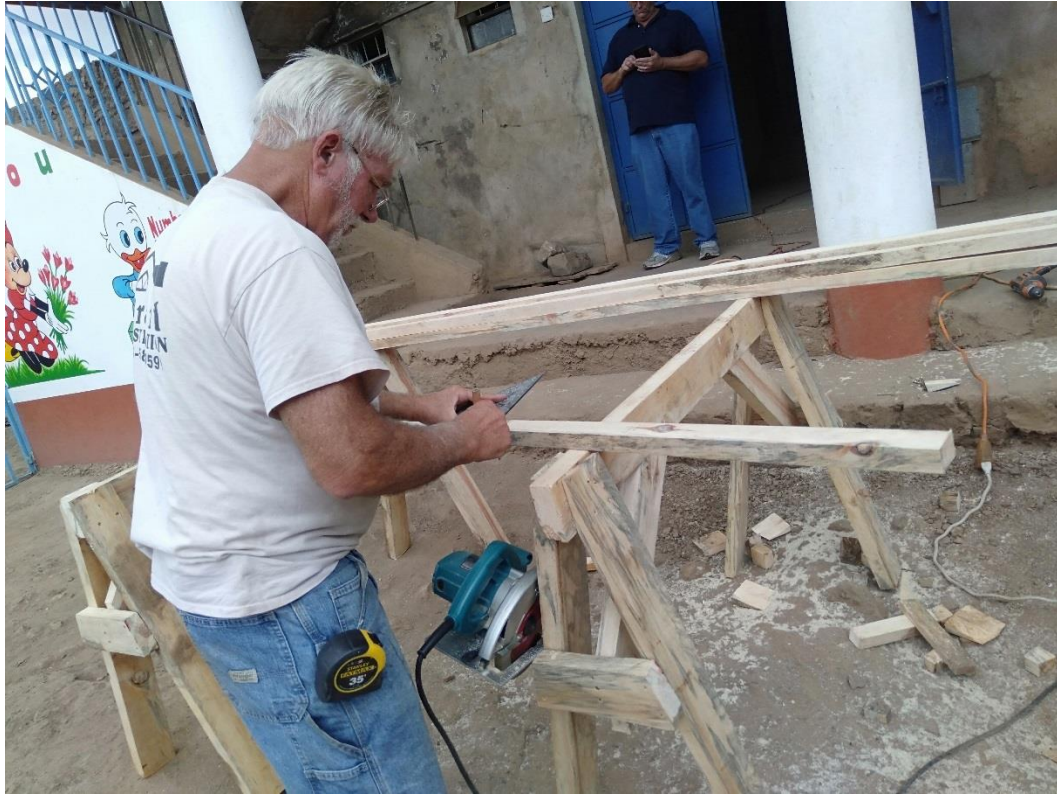
Onas busy at work