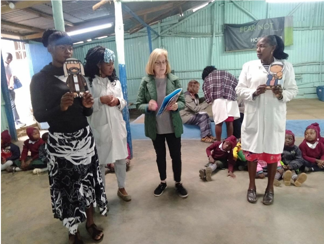
Art and craft