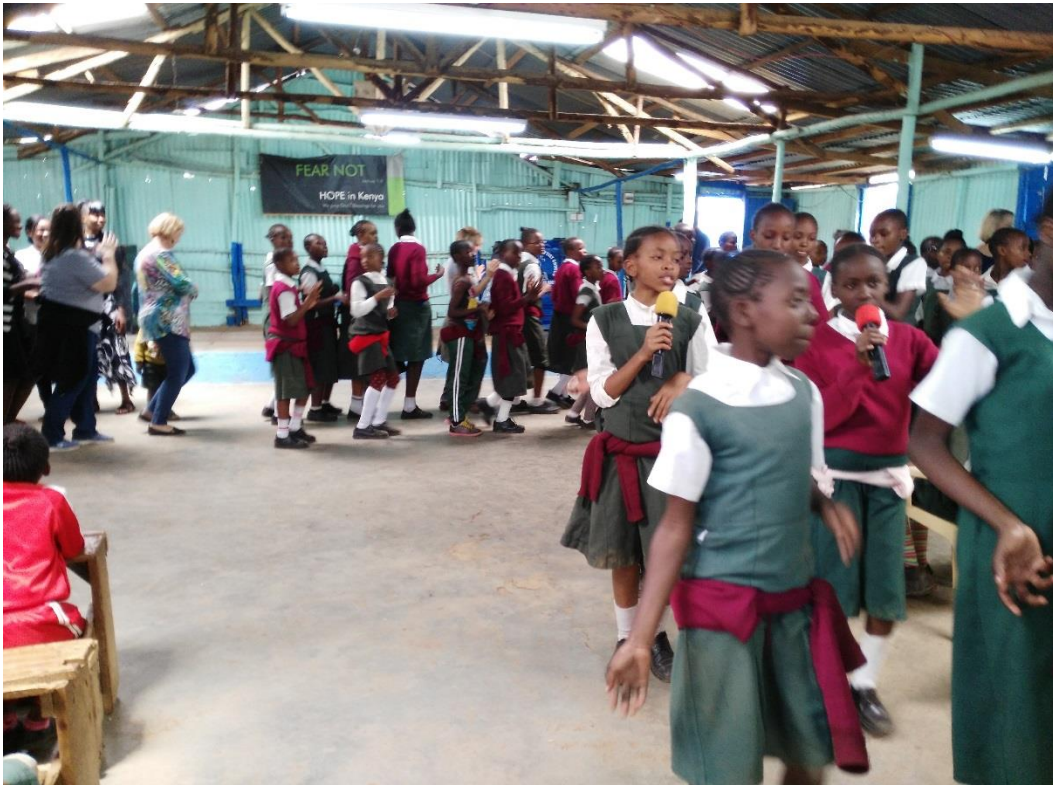
Traditional dances and fun