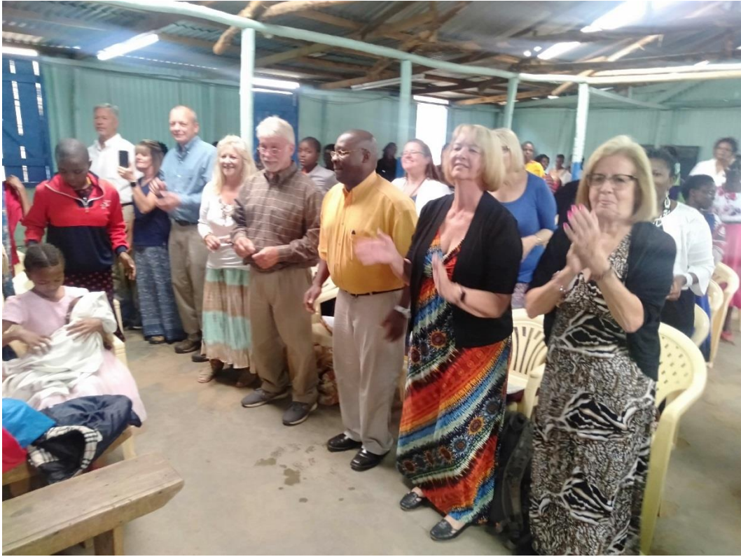
Main church service