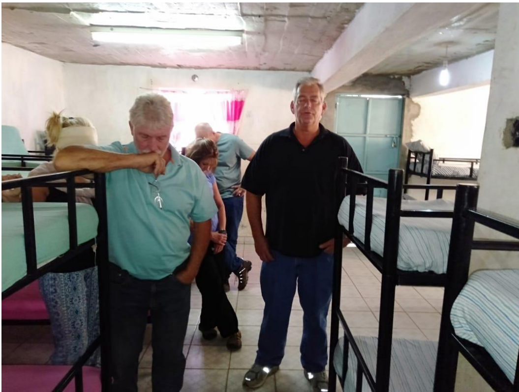
The team prays for the girls