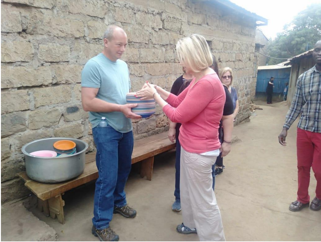
Time to serve lunch