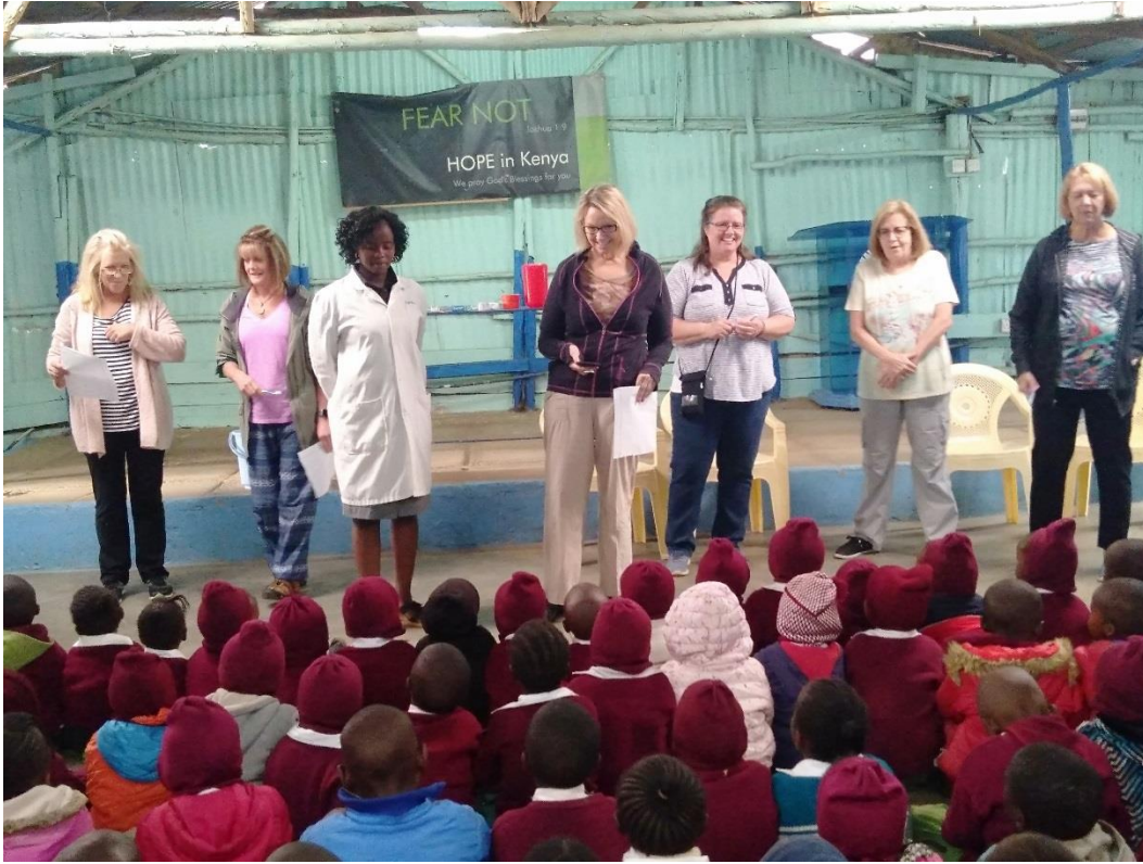
Dental hygiene class