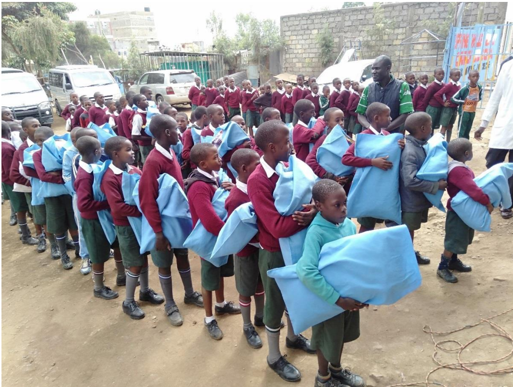
The boys of Joshua boys get pillows and beddings!!