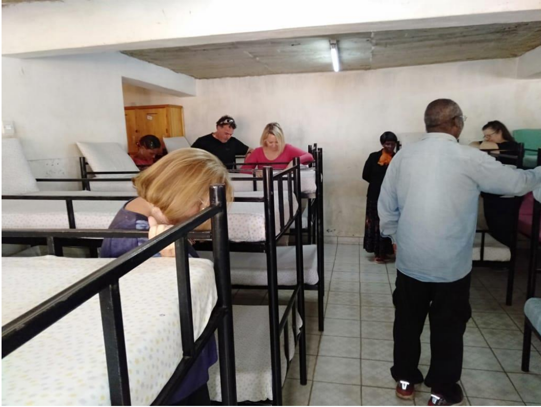
Talitha Koum dorm tour