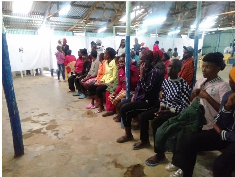
Community medical camp

The team got to leave after 5pm after a long work day having been a blessing to the community of Spring Valley.