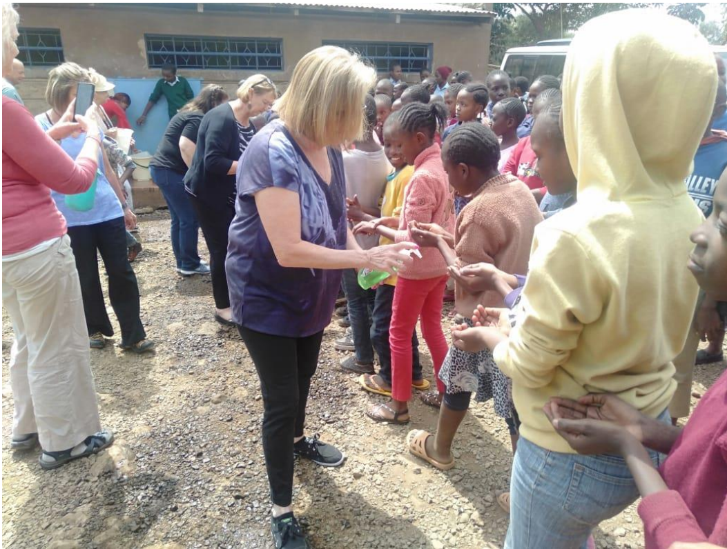
The team washing the children's hands for lunch