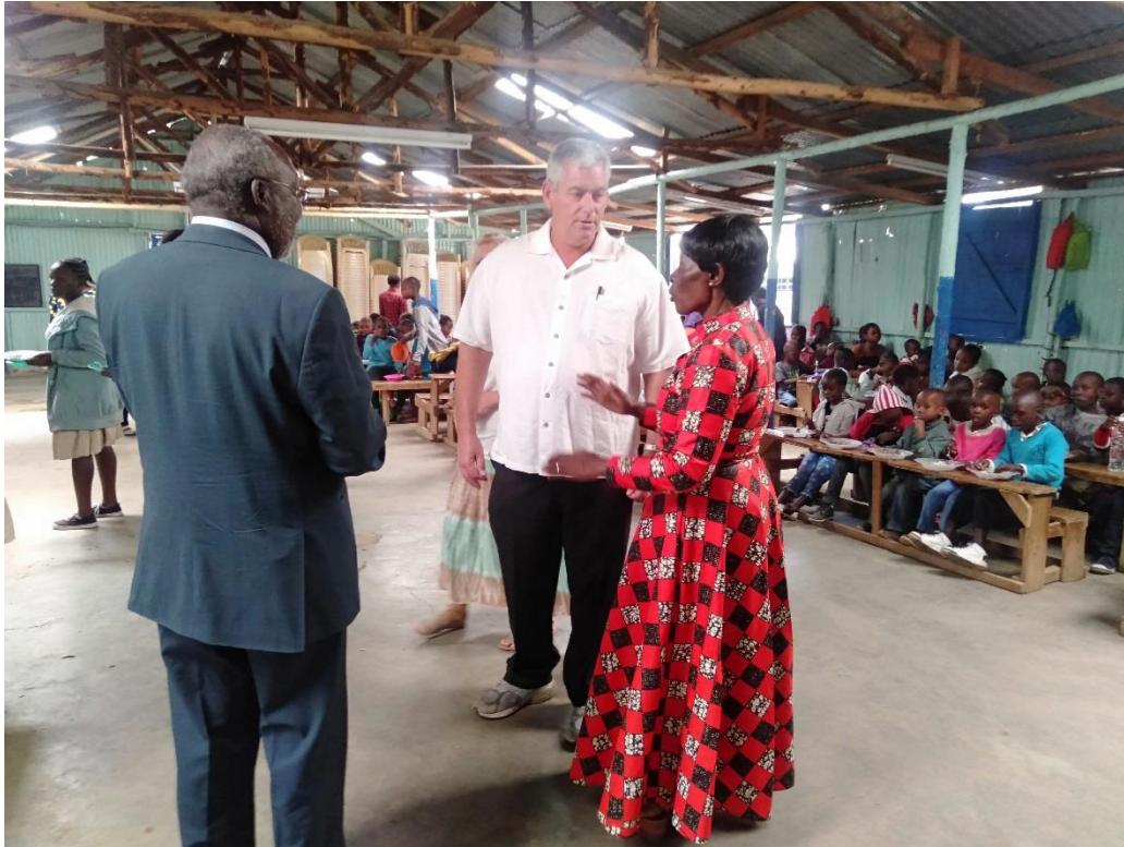
End of day one