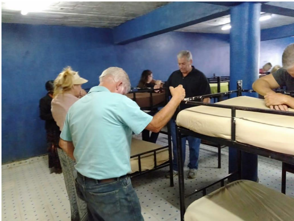
Joshua boys dorm tour