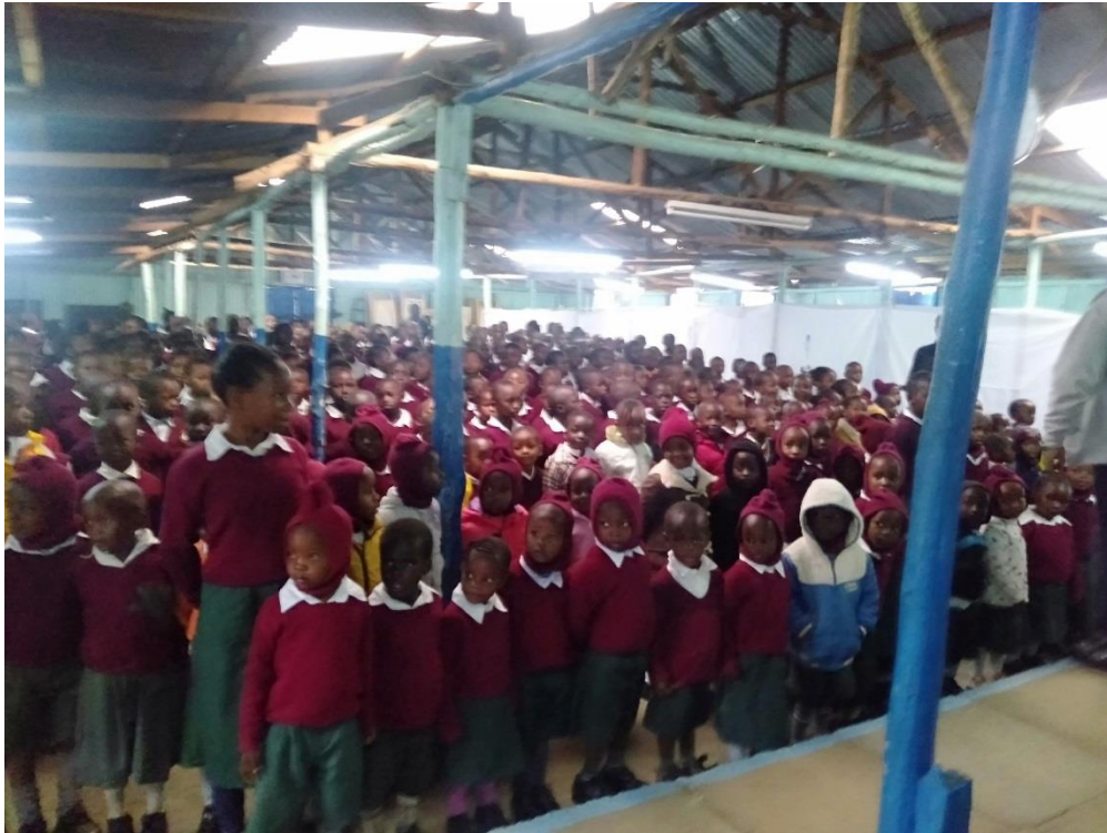
Monday assembly before children's medical camp

the medical camp and the treatment and medications they received. The medical team was able to treat 310 children on this day!!!