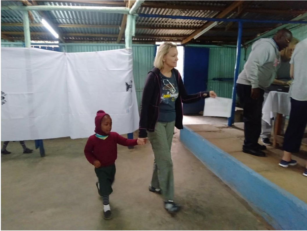
Kids medical camp