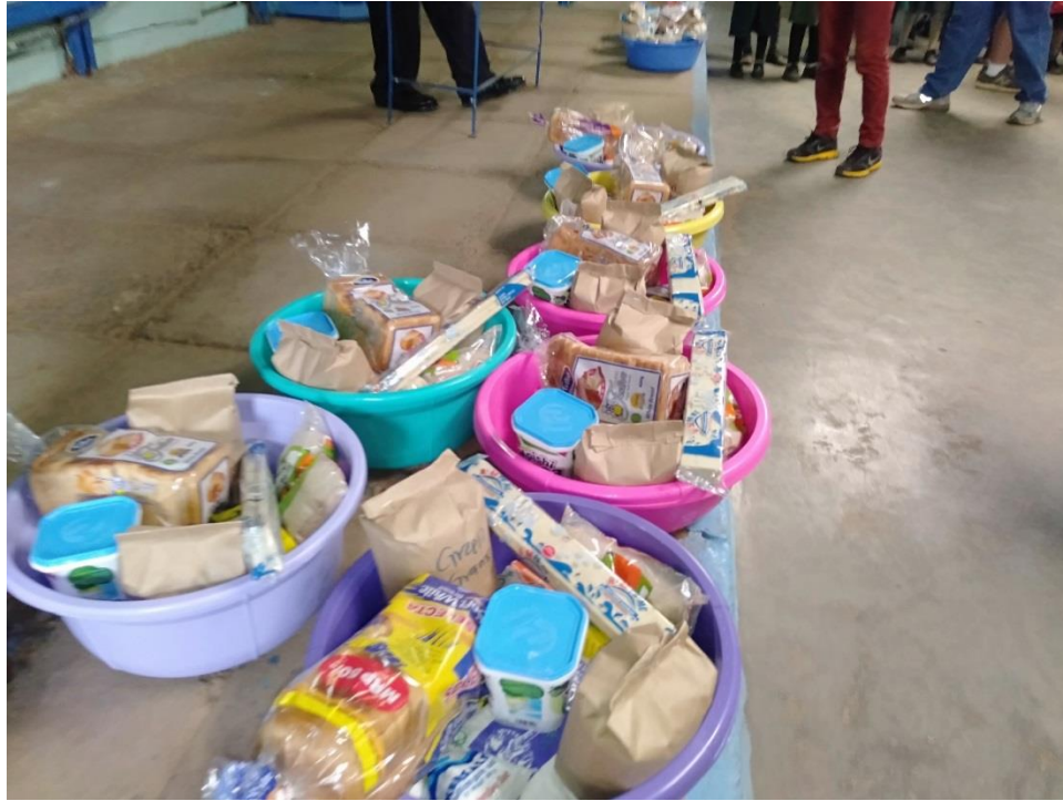
Food baskets and home visits