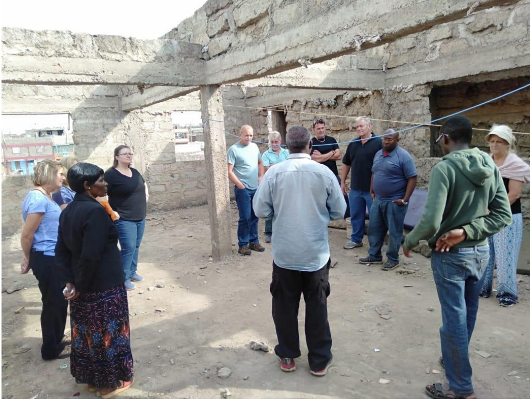
The unfinished upper floor of the Joshua boys' dorms