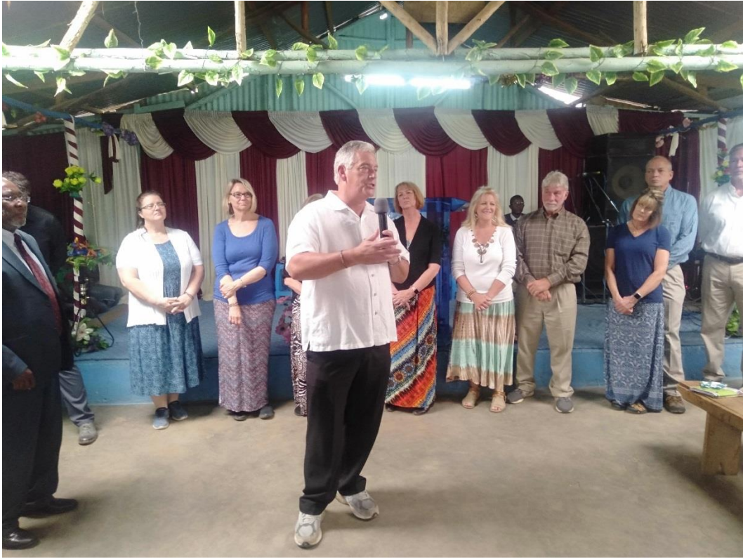
The team is introduced during the main church service