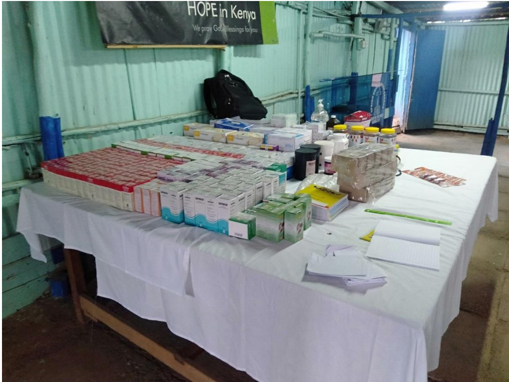
Medications for the medical camp